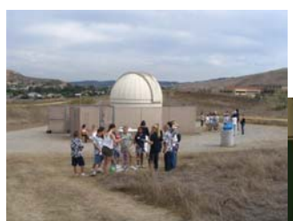
Figure 1. The UCI Observatory