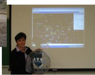
Figure 2. Night Sky Demo