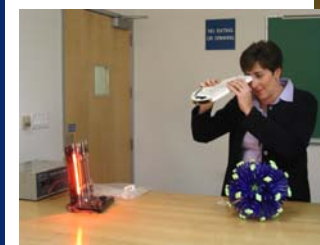
Figure 3. Spectroscopy Demo