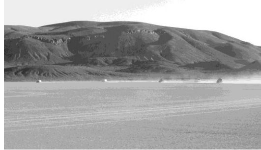
Our vehicles leaving camp at the alkali lake called Upper High Dry. (Dave Hollecker)

The Milky Way was indeed milky looking in the clear air and its glow was sufficient to allow us to walk out on the playa in confidence. This had been our longest day of driving.