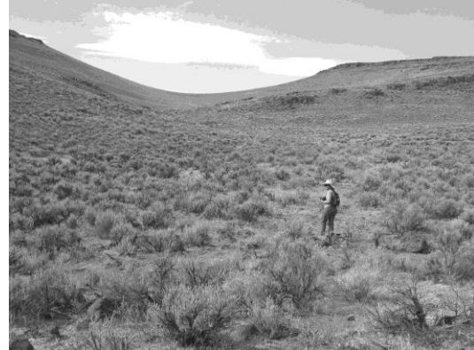
At the beginning of the Fly Canyon alternate hike. The trail went over the saddle shown on the horizon.

night it tried to rain, but managed only a slight wetting of the landscape. However, this did bring a cold front through.