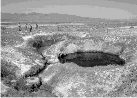
Double Hot Springs, now fenced due to the danger of the extremely hot water. (Rose Ann Tompkins)

The next morning we drove a short distance to Fly Canyon to see trail traces coming out of Mud Meadows. We then took a short hike into the canyon to look at some emigrant inscriptions.