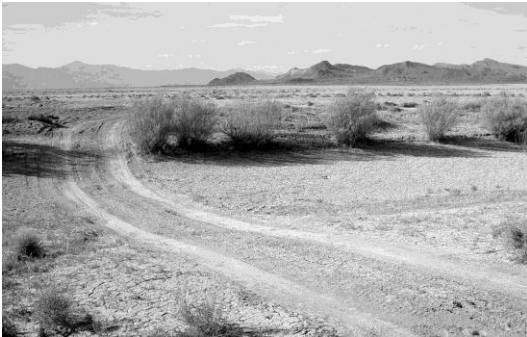
Crossing the Black Rock Desert, showing the Quinn River crossing which is dry at this time of year. Note the Black Rock in the distance. It is visible for many miles. (Marian Johns)

As we followed the trail across the Black Rock Desert and crossed the dry bed of the Quinn River, the Black Rock landmark got closer and closer. We stopped at the hot springs at the base of Black Rock and then pulled into our camp at a dry lakebed called Upper High Dry. This large alkali playa with its white surface and surrounding black mountains had an almost surreal aspect to it.