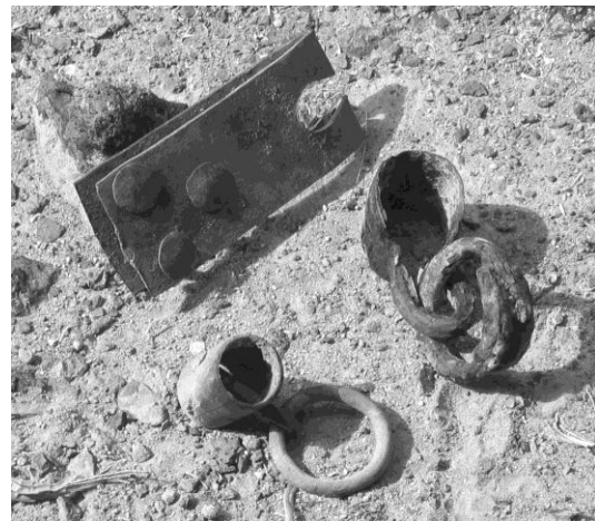
Wagon artifacts found on the Fly Canyon alternate hike. (Marian Johns)

The following day High Rock Canyon was on the agenda. This was a day of rock walls on both sides, caves with emigrant inscriptions, gunfire of hunters echoing off the rocks, some challenging driving, a hunt for a grave and spring. It ended in the yellow aspens at Stevens Camp. The night proved to be our coldest yet.